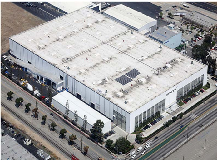
Hawthorne (Los Angeles) Headquarters