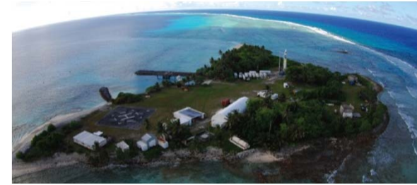
Omelek, Kwajalein Atoll