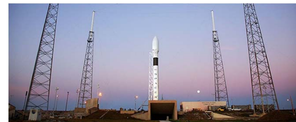
SLC-40, Cape Canaveral